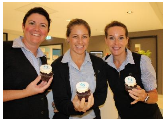
Photo above - Celebrating International Nurses and Midwives day 2020 with a 'Thank You' cupcake from Northern Beaches Hospital Executive